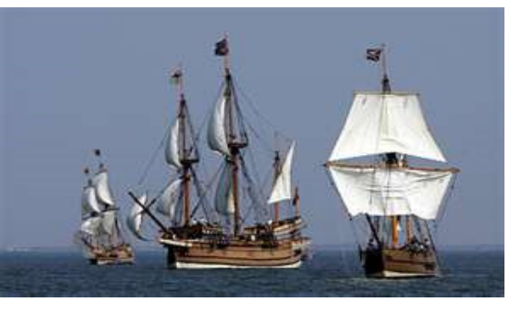
The 3 ships that came to Jamestown