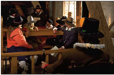
House of Burgesses

1st elected law making body in English America